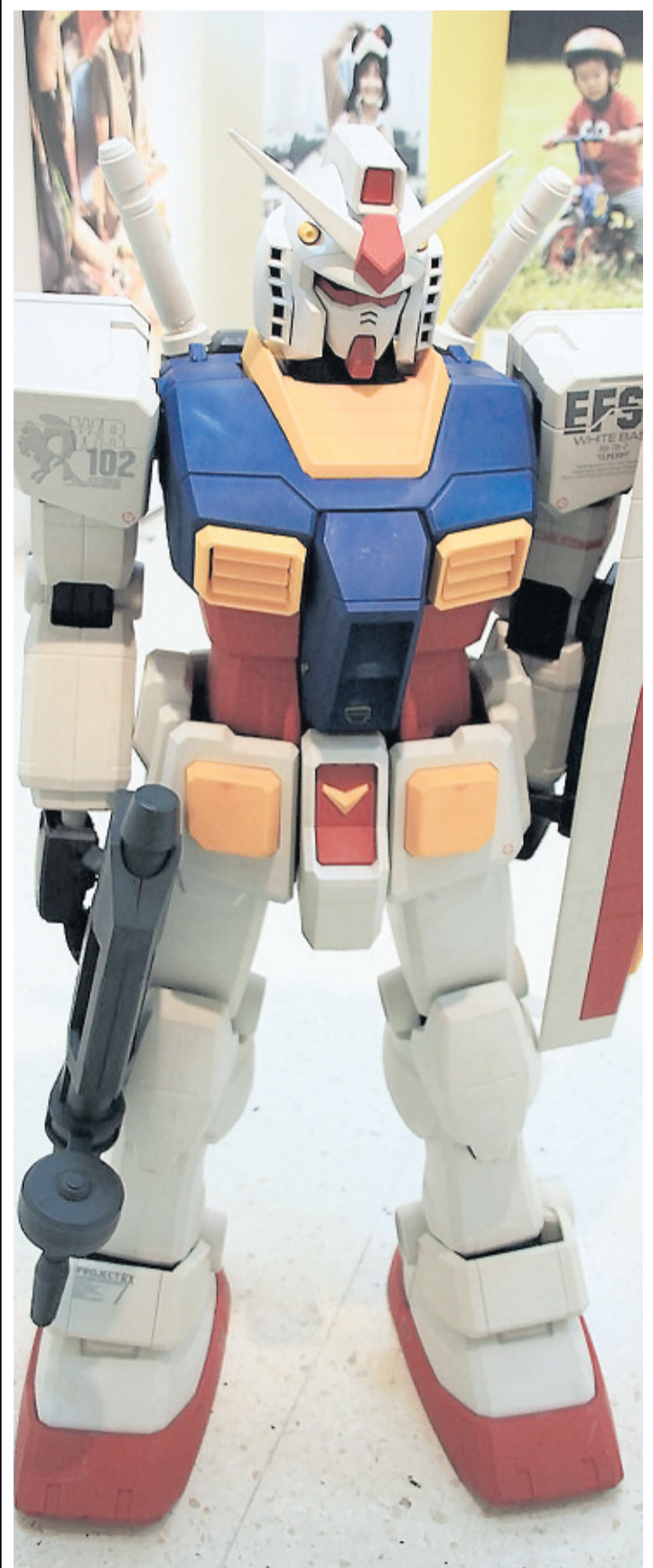
Mobile Suit Gundam – character from a televised anime series that premiered in Japan in 1979.

Apply Online: www.mona.uwi.edu/apply For detailed requirements visit www.mona.uwi.edu/carimac or call CARIMAC at (876) 977-2111, 927-1481 977-1396