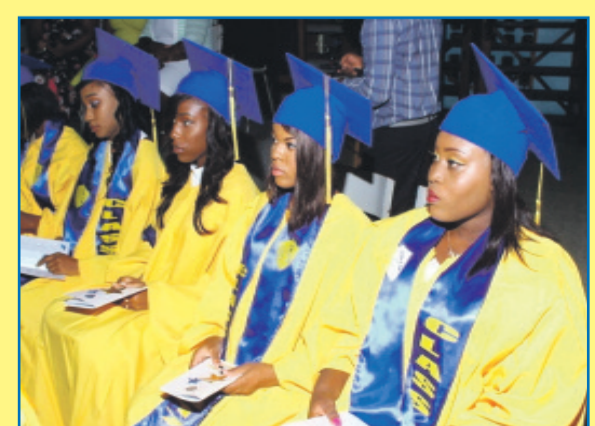
Merl Grove High School Graduating Class of 2017